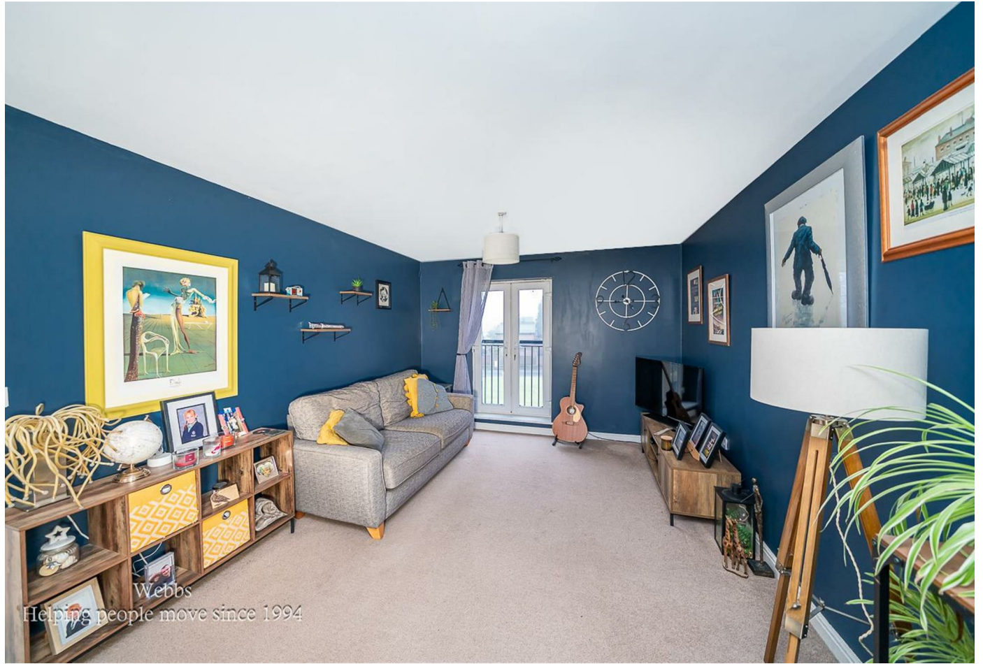
Webbs Helping people move since 1994