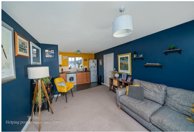
Webbs Helping people move since 1994