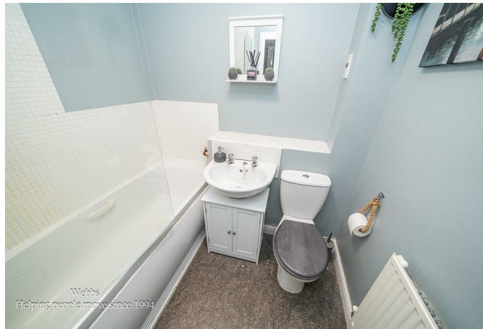
Webbs Helping people move since 1994