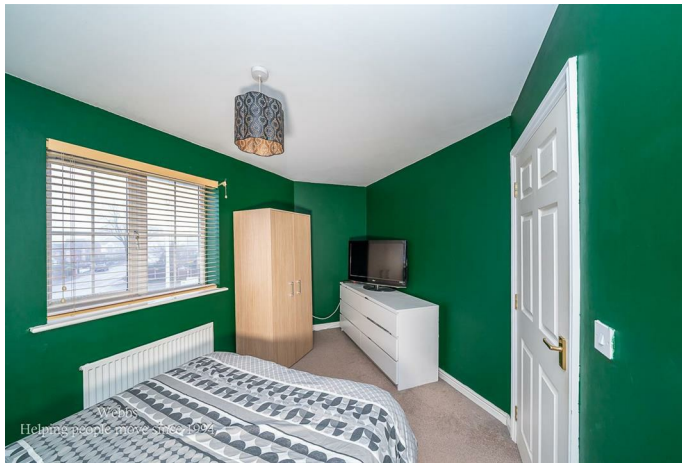
Webbs Helping people move since 1994