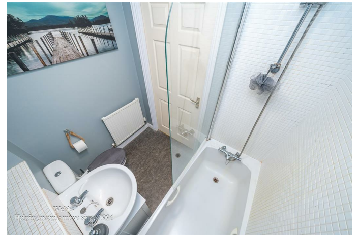
Webbs Helping people move since 1994