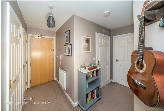
Webbs Helping people move since 1994